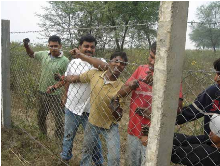
We started installing perimeter fencing.