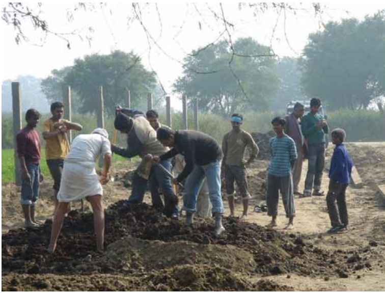
We dug holes along the entry road for 30 trees.