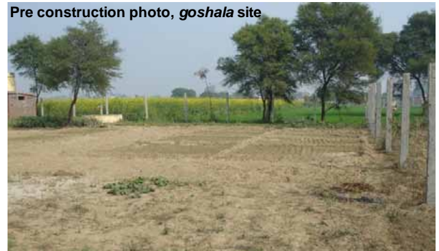
Pre construction photo, goshala site