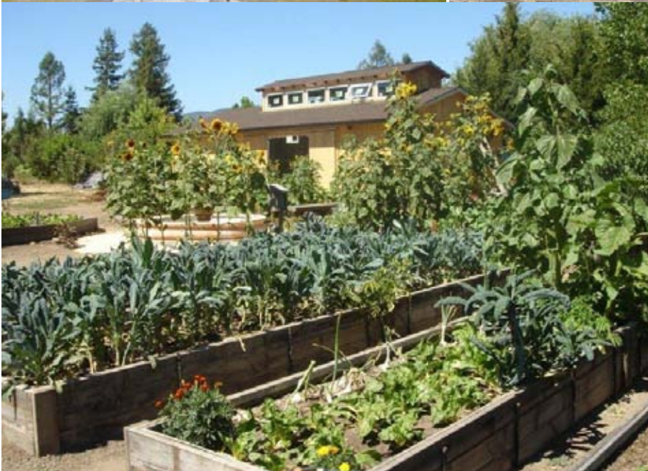
Top Left: Old barn

Top Right: Site where old barn stood, with dhuni, lotus temple and pond in background. Everyone who steps foot in the Ashram grounds relates how open and expansive the land feels without the old dilapidated structure — our 2 1/3 acre property feels much bigger now.