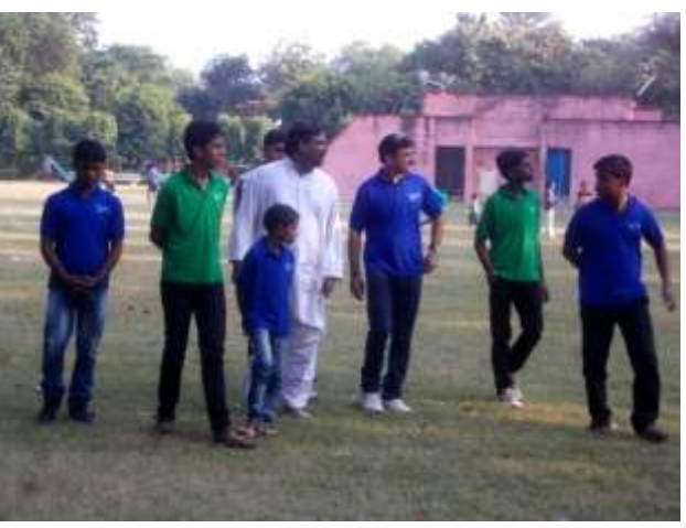
Later we had the opportunity to repay their hospitality when a group of 75 boys and girls from the SOS village joined us at the ashram for lunch and eco-park visit.