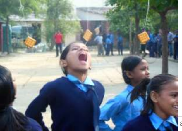
a g e