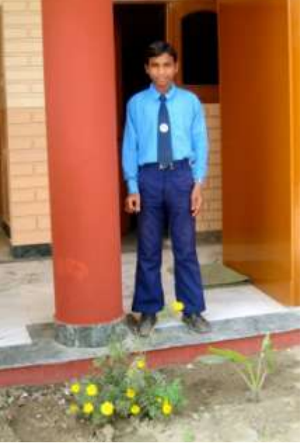
Sponsor a child! Be a part of Bal Ashram's family!