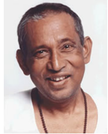
Aghoreshwar Baba Bhagwan Ramji